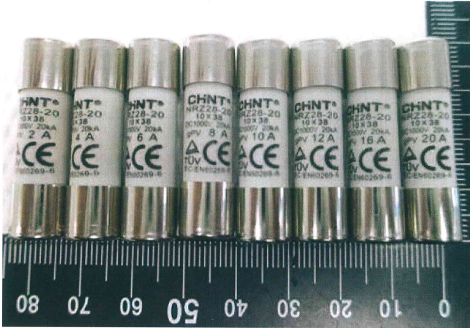
Images of NRZ28-20